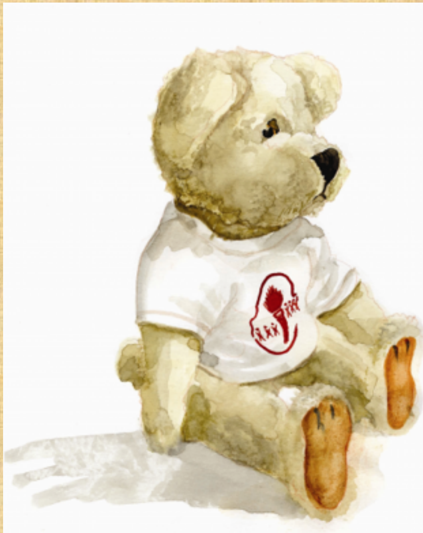
‘Ursus Humanisticus’ Knubbe the bear